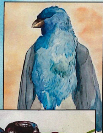
Sketch by Open House 5 One W

An Open House/Reception will be held in the evening on Thursday, July 11, 2024, to give students, families, and teachers an opportunity to share in the two-week experience and see the artwork created during camp.